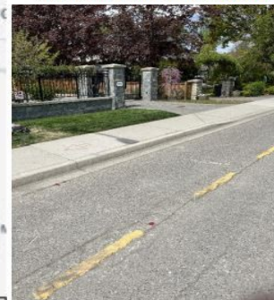
Turnaround point (red dot/nail) and brown sewer cover in driveway

2.5km Turnaround - Mag nail at turnaround is 1.95m from curb on west side of road and 2.15m from concrete barrier (0.3m wide) on east side of bike path. Nail is 6.08m south of south edge of driveway for house #2668 Abbott St. and 3.88m north of north edge of driveway for house at #2678 Abbott St. Nail is 2.32m from sign pole (0.06m OD) for "Maximum 30 km/h" sign on the concrete barrier on the east side of the bike path. Refer to photo.