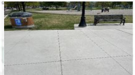
Start point (red dot/nail) in City Park